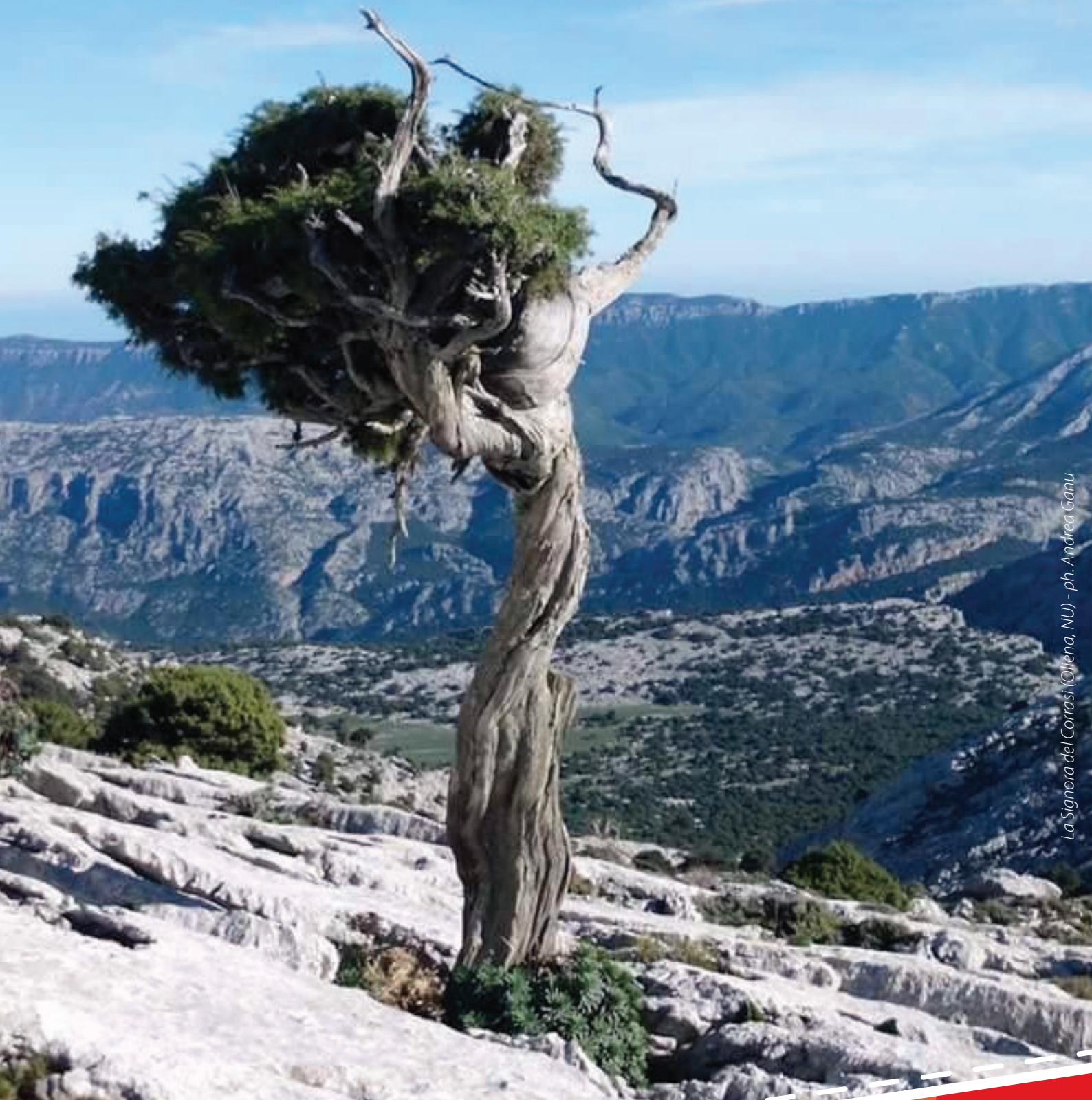
La Signora del Corrales (Oliena, NU)